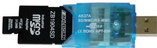
Micro-SD memory card, including USB card reader