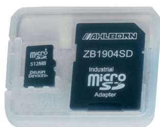
Micro-SD memory card (as replacement)